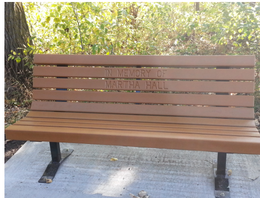
The selected bench is pictured above.

Bench placement will be done by parks staff as time and weather allow. Every effort will be made to complete installation within four weeks of receiving the bench, except in the winter months.